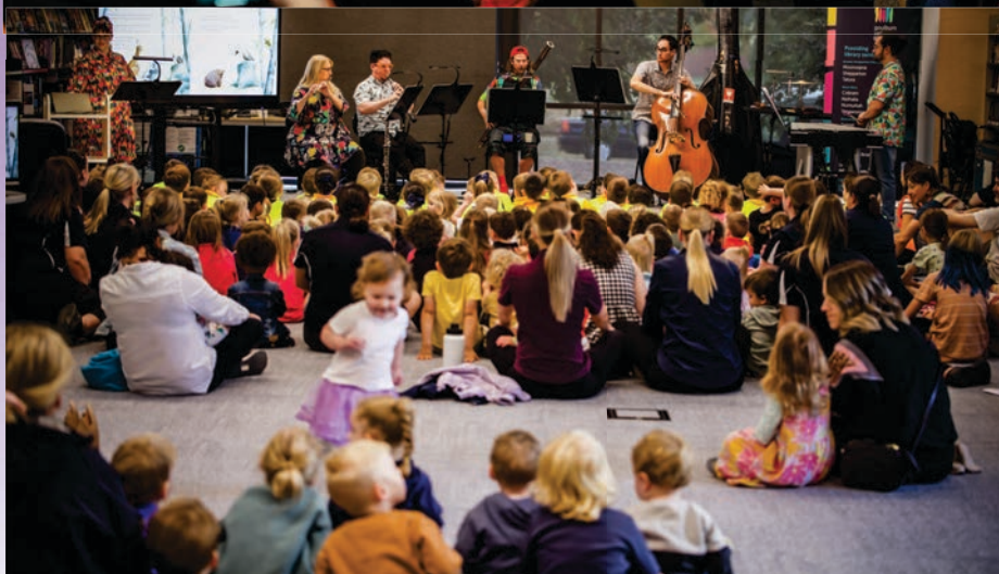
Converge on the Goulburn 2023